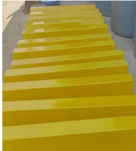
FRP MODULER LUANDERS