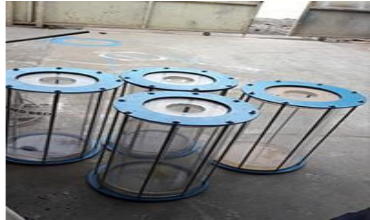
Acrylic Air Seal Pot