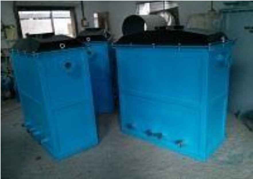
FRP CUSTOMIZED TANK