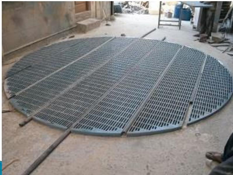
FRP CUSTOM GRATING