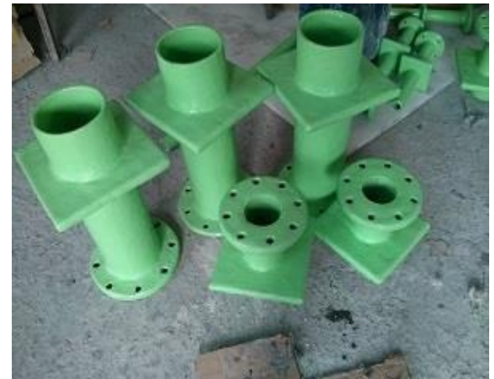
FRP PUDDLE PIPE