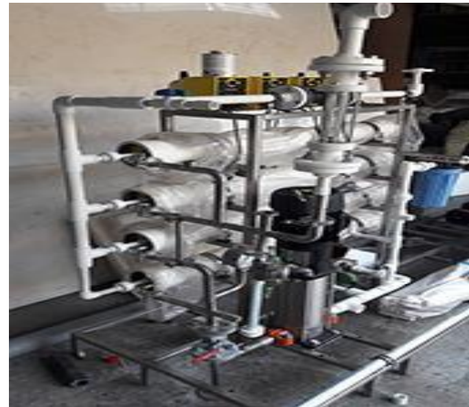
PVC Skid Piping