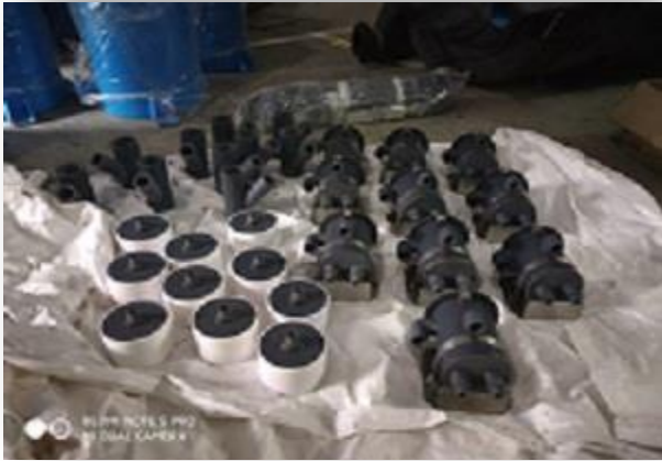
PVC CUSTOM JOB