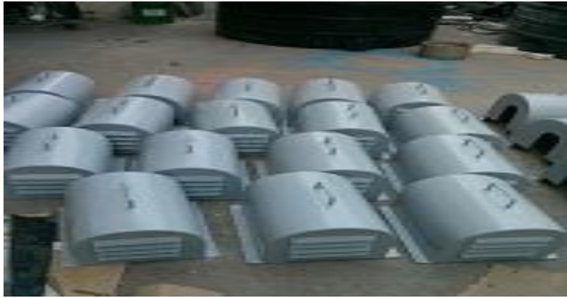
FRP MOTOR CONOPY COVER